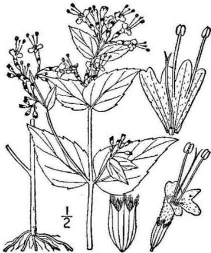
Cunila origanoides Courtesy Britton & Brown Illustrated Flora 2nd Edition (1913). An Illustrated Flora of the Northern United States and Canada Volume III