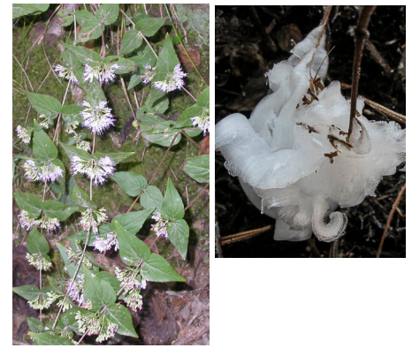
Cunila origanoides